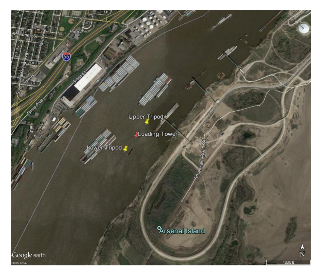
Figure 1: Aerial photo (Google Earth Imagery Date 4/2/2016 – Accessed 6/23/2017) of the Cahokia Acres, L.L.C. project limits.